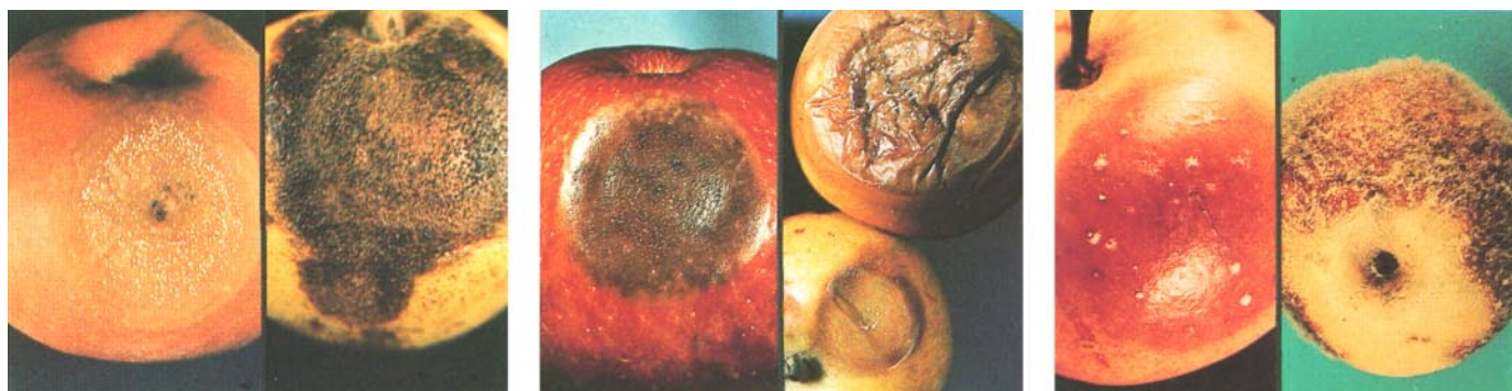
1. Northwestern anthracnose or bull's-eye rot