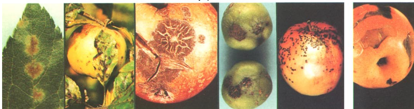
8. Apple scab